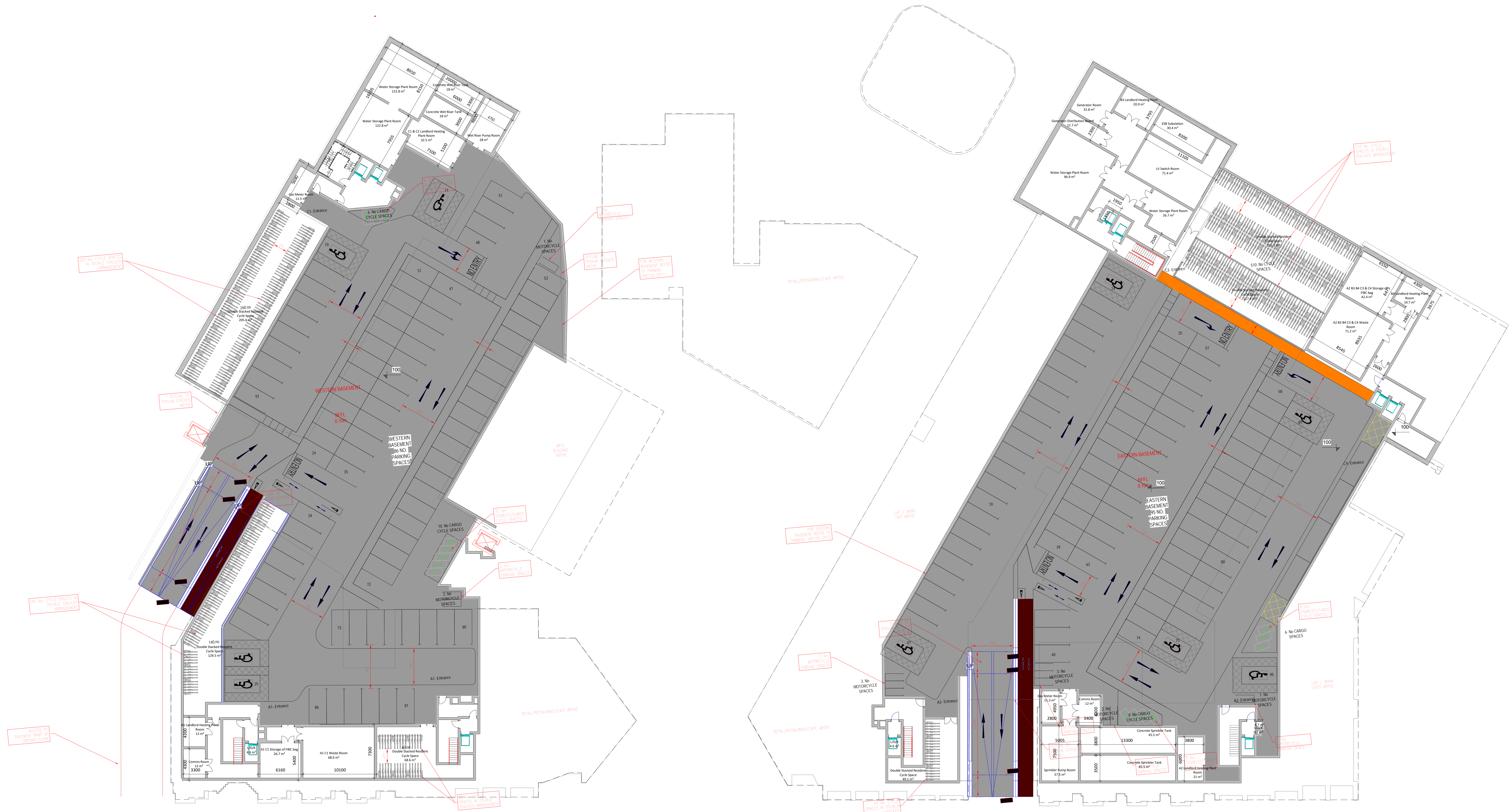
Basement -Level B1